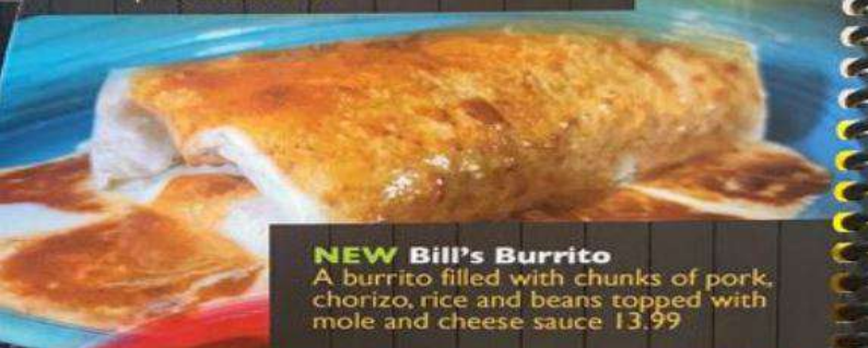
NEW Bill's Burrito A burrito filled with chunks of pork, chorizo, rice and beans topped with mole and cheese sauce 13.99