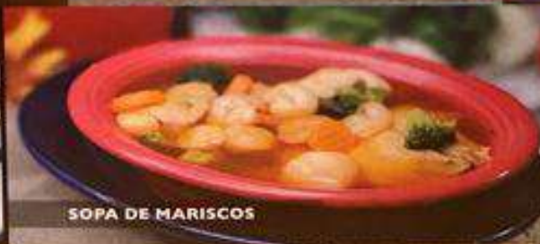
SOPA DE MARISCOS

Seafood broth with shrimp, scallops, tilapia, and california veggies; served with tortillas - bowl 17.99