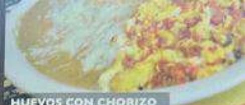
HUEVOS CON CHORIZO