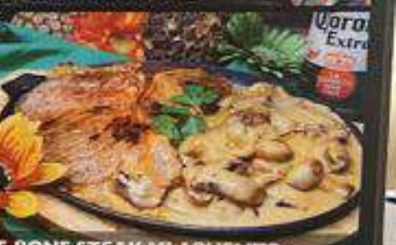
T-BONE STEAK MI ABUELITO