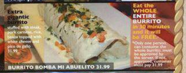
BURRITO BOMBA MI ABUELITO 31.99

Eat the WHOLE ENTIRE BURRITO in 30 minutes and it will be FREE!