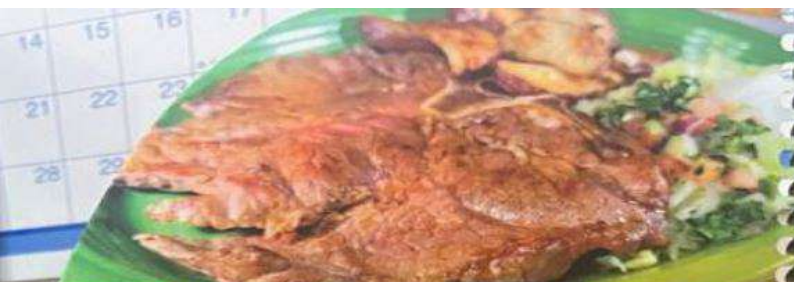
NEW Steak Indiana T-Bone steak served with homemade seasoned potato wedges, and a pico salad 17.99