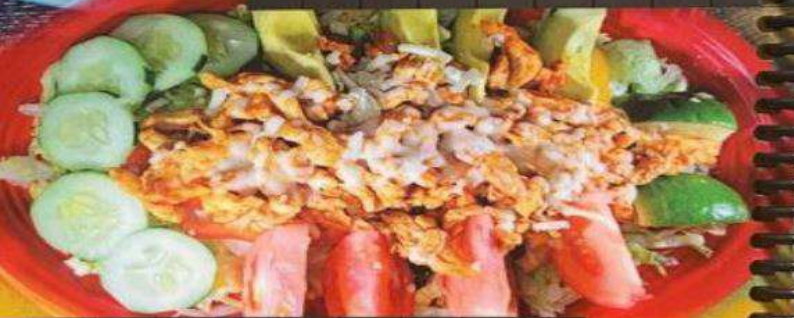
NEW Country Salad Grilled chicken strips on a bed of lettuce, topped with avocado slices, cucumber slices, bell peppers, shredded cheese, tomato wedges and lime slices 12.99