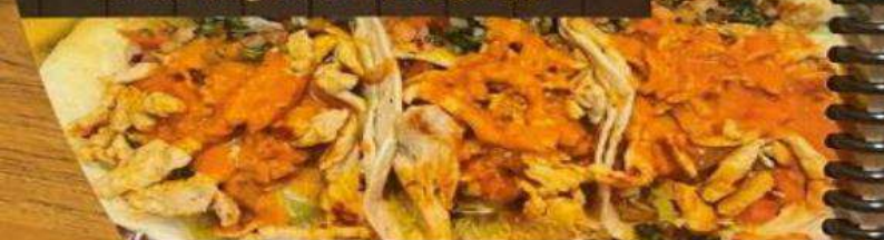
NEW Tacos Diabla 3 grilled chicken tacos in a flour tortilla, topped with lettuce, pico de gallo and our homemade Diabla sauce; served with rice and beans 13.99