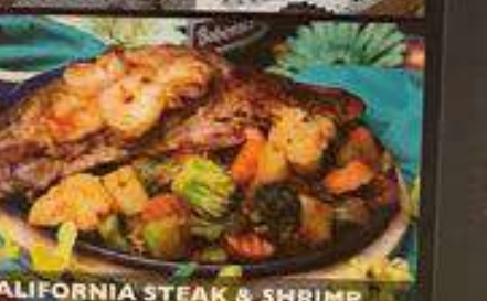
CALIFORNIA STEAK & SHRIMP