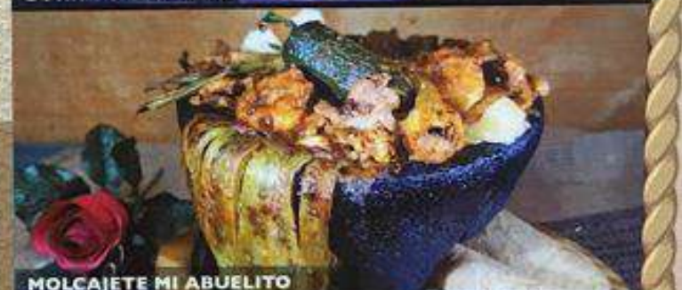
MOLCAJETE MI ABUELITO