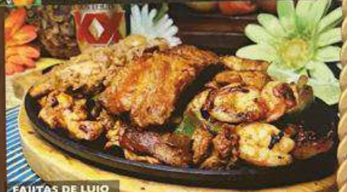
FAJITAS DE LUJO

We bring each fajita to your table in a sizzling cast iron skillet. Each fajita dish is sautéed with our homemade red sauce, onions and bell peppers. Served with pico de gallo, sour cream, salsa, rice, beans and three flour tortillas.