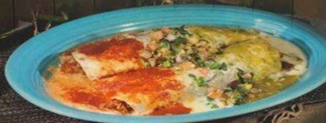
NEW Burritos Toluca Two burritos filled with shredded carnitas and chorizo covered with red, green and cheese sauce topped with pico de gallo 12.99