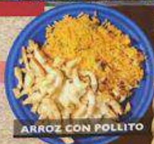
ARROZ CON POLLITO

Appetizers • Salads • Vegetarian • Burritos • Enchiladas • Quesadillas • Fajitas • Specials • Sandwiches • Kids