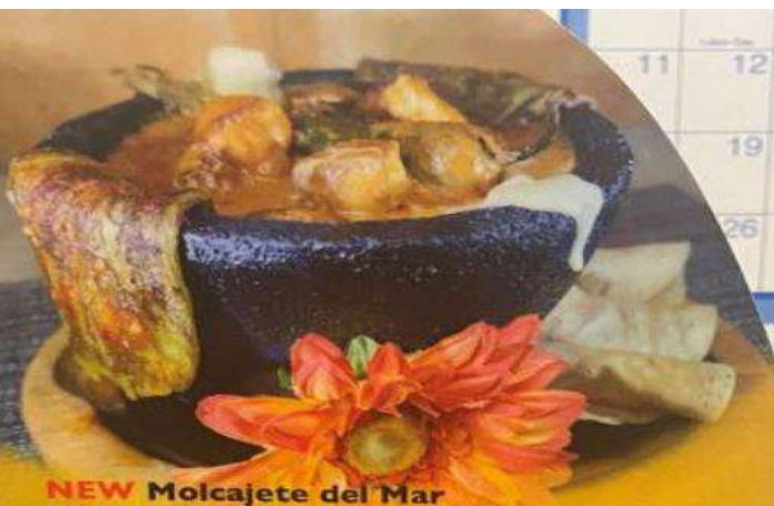
NEW Molcajete del Mar Grilled shrimp & scallops, cactus, onions, white melted cheese and our homemade creamy chipotle sauce, garnished with a grilled whole jalapeño. Served with rice, beans, a pico salad and tortillas 25.99