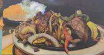
COSTILLAS CON ZUCCHINI

Pork tips cooked with green sauce. Served with rice, beans, pico salad and tortillas 13.99